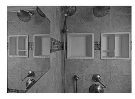
Figure 3. Grout around the mirror to seal and finish.

8. Caulk or grout around the edges. Tape or brace the mirror in place until the mastic and caulk or grout is set-up and secure.